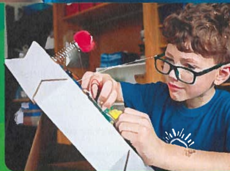
A second grader gains confidence as he wires his transmitter and sends Morse code messages.