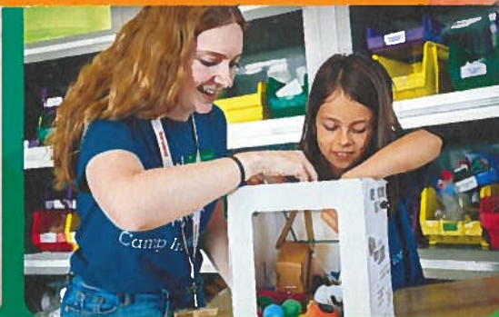
An Instructor empowers a third grader to build creative problem-solving skills while designing her own claw machine.